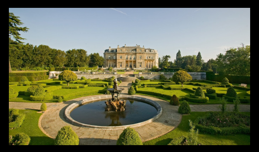
Traditional or Contemporary